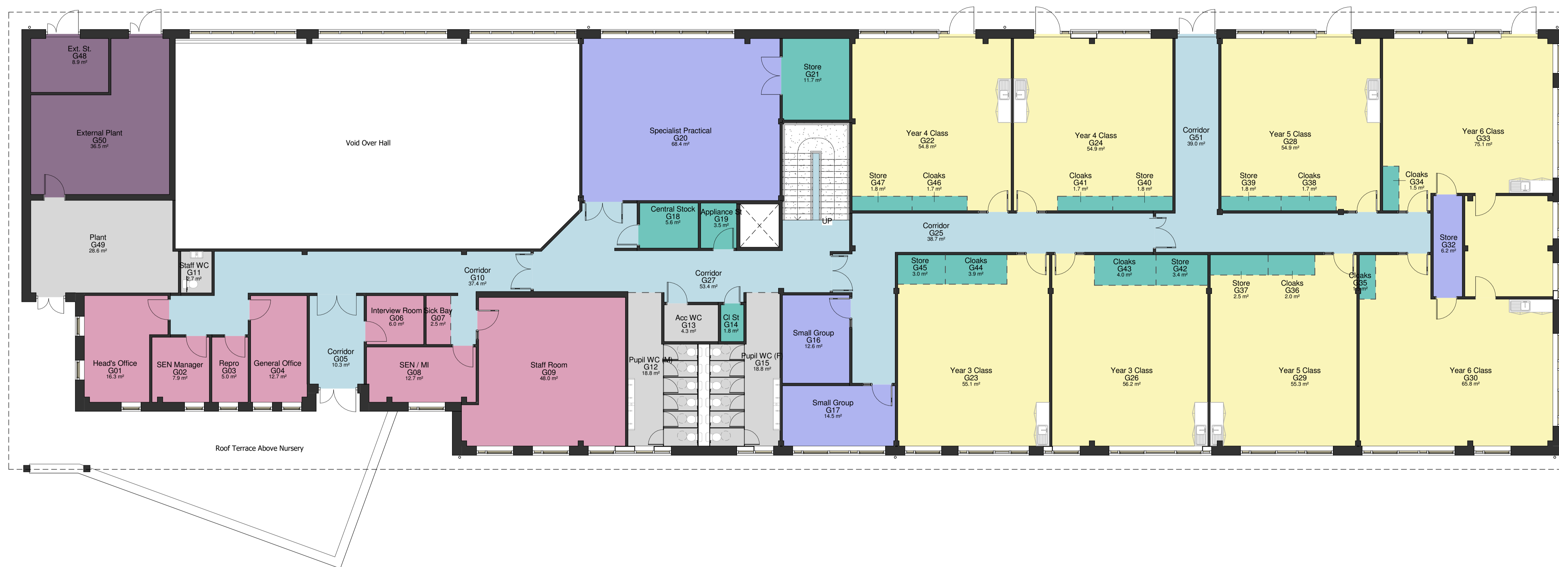
Proposed Ground Floor 1 : 100

Rev: Date: Drawn: Checked: Description: PLANNING ISSUE